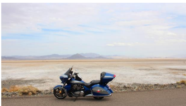
Soda Springs on Zzyzx Road