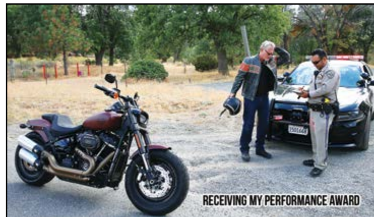
RECEIVING MY PERFORMANCE AWARD

riding all the new Softails on the Angeles Crest Highway, it became immediately apparent that the new line is designed to inspire a bloodline of young, aggressive riders who love power and performance, and I am very proud of my performance award.