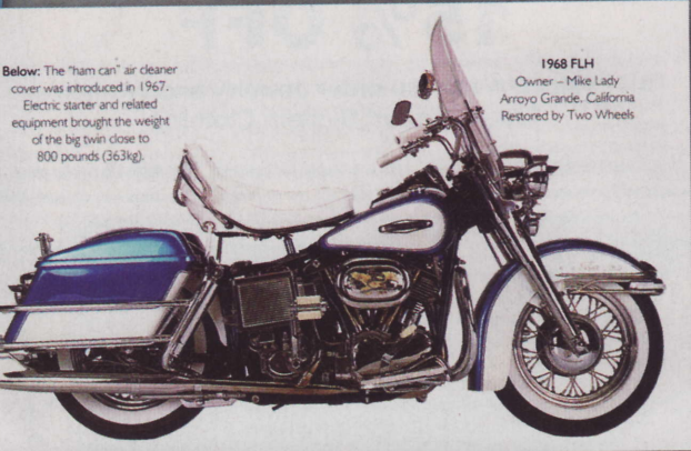
Below: The "ham can" air cleaner cover was introduced in 1967. Electric starter and related equipment brought the weight of the big twin close to 800 pounds (363kg).