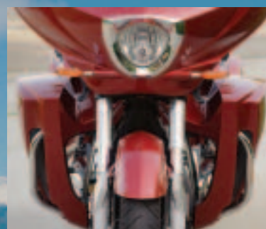
COMFORT CONTROL SYSTEM OPEN