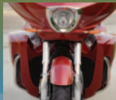
COMFORT CONTROL SYSTEM CLOSED

Let's talk about "her". If she has any say about it, the CCT is an easy sell. You know the old adage, "if Mama's not happy nobody's happy," and Mama will love the CCT. It's without a doubt Victory's touring gold standard. The plush passenger seat has its own heat control and the backrest is comfortably contoured, plus Victory offers optional armrests (with cup holders). The passenger floorboards adjust up or down by 2 inches and allow for 10 degrees of angle adjustment and did I mention 41.1 gallons of storage? The largest storage capacity of any touring bike and if she needs more, an optional luggage rack mounts on top of the tour pack. For Daddy's macho factor the tour trunk literally clips off for a cool solo