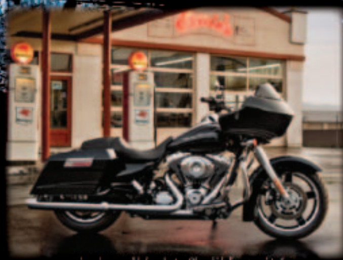
winner is responsible for sales tax, title, vehicle license, registration

BIKE SHOW 1st Place-$2000 Cash 2nd Place-Extended Bags 3rd Place-Chop Pak